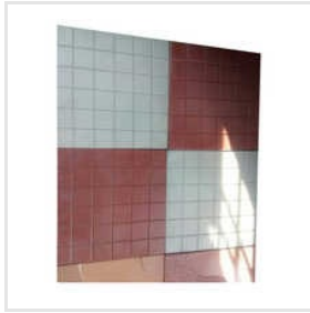
Designer Marble Tiles