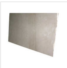
Crema Marfil Marble Slab