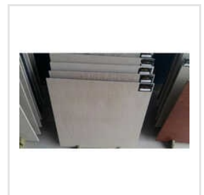
Antico Granite Slab