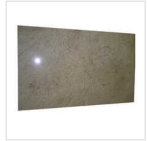
Kashmir Gold Granite Slab