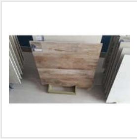
Desert Brown Granite Slab