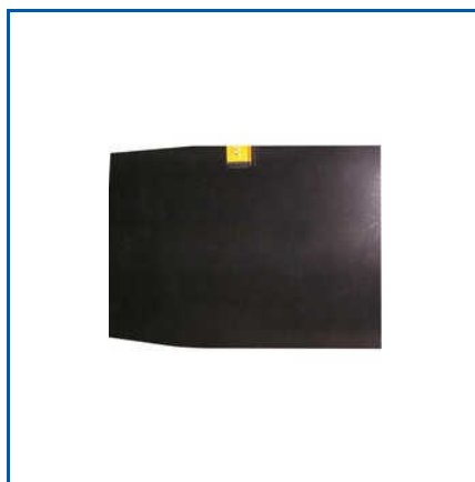
ABSOLUTE BLACK GRANITE SLAB