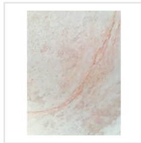
Indian Granite Slab