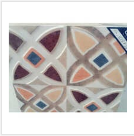
High Quality Marble Tiles