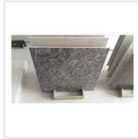
Deep Ocean Granite Slab