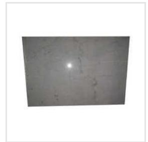
Carrara White Marble Slab