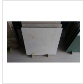
Ivory Granite Slab