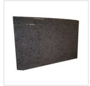
Blue Eyes Granite Slab