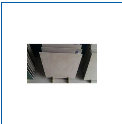
BLACK GALAXY GRANITE SLAB

Absolute Black Granite Slab, Antico Granite Slab, Black Galaxy Granite Slab, Blue Eyes Granite Slab, Brown Granite Slab, Brown Marble Tiles, Carrara White Marble Slab, Crema Marfil Marble Slab, Deep Ocean Granite Slab, Desert Brown Granite Slab, Designer Marble Tiles, Empredor Dark Marble Slab, High Quality Marble Tiles, Indian Granite Slab, Ivory Granite Slab, etc.