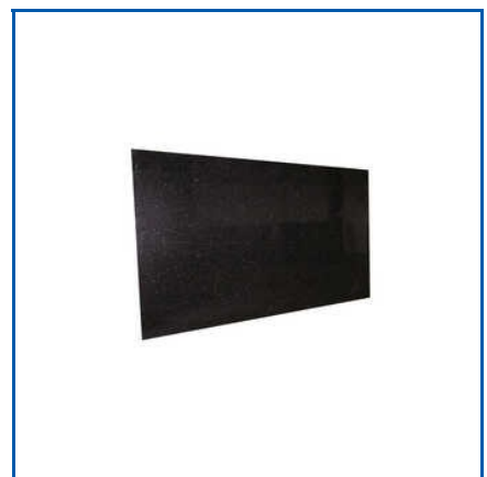
BLACK GALAXY GRANITE SLAB