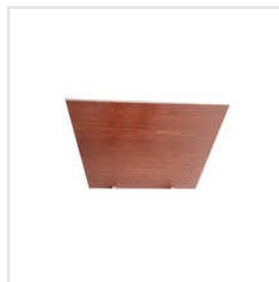
Brown Granite Slab