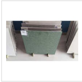
Lapto Granite Slab